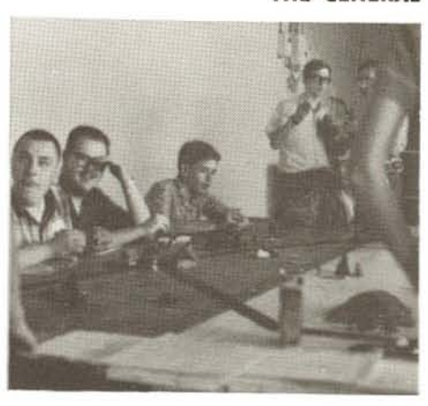
Attendees at 2nd Annual Lake Geneva Convention, sponsored by IFW, muse over a typical tactical exercise in one of many held in the horticultural Hall at the famous Summer resort.

Vol. 6, No. 4 (Nov-Dec 1969) recapped the IFW's 2nd annual Lake Geneva Convention; another two-day affair more successful than even the first one. A cover montague and the inside spread of this issue recorded pictorially the great appeal conventions of this nature have to the wargame buff. The annual Lake Geneva affair, perhaps more than any other single event, has set the standard for a multitude of wargame conventions yet to come. Two of the biggies have been mentioned briefly in another section of this issue. Because they will be milestones of their own, it behooves us to devote the final paragraphs of this article to elaborating on what attendees can expect to benefit from these two major conventions.